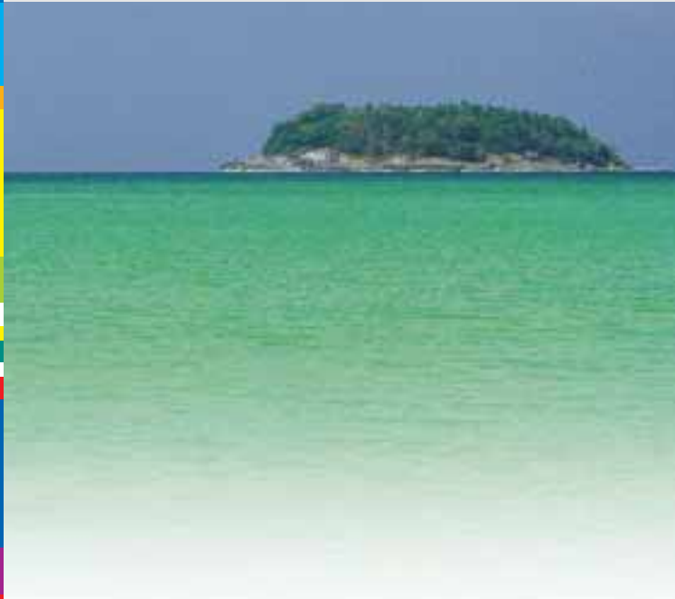
PERSPEX™ FROST Emerald