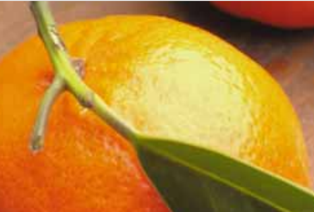
PERSPEX™ FROST Mandarin